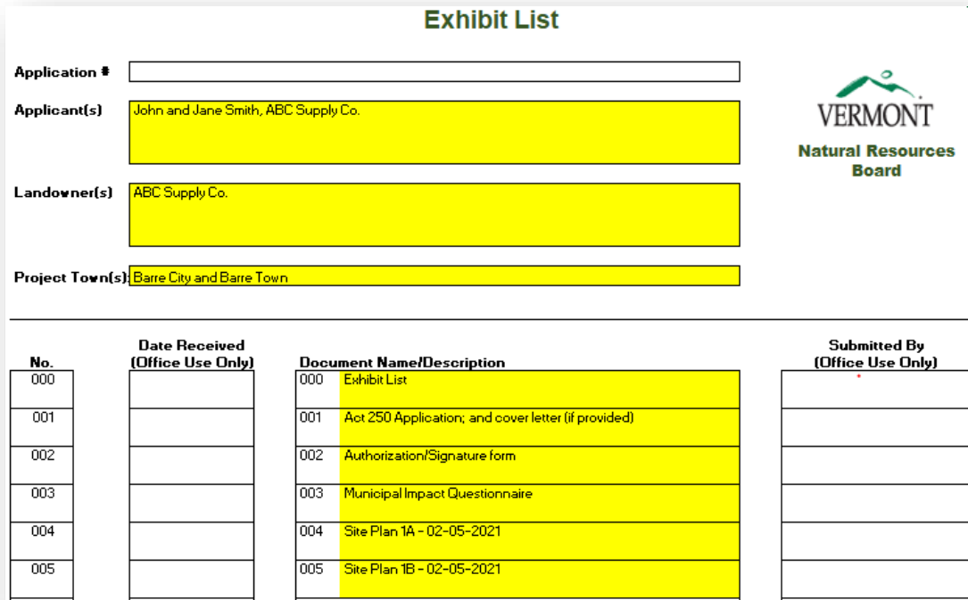
Exhibit File Formats